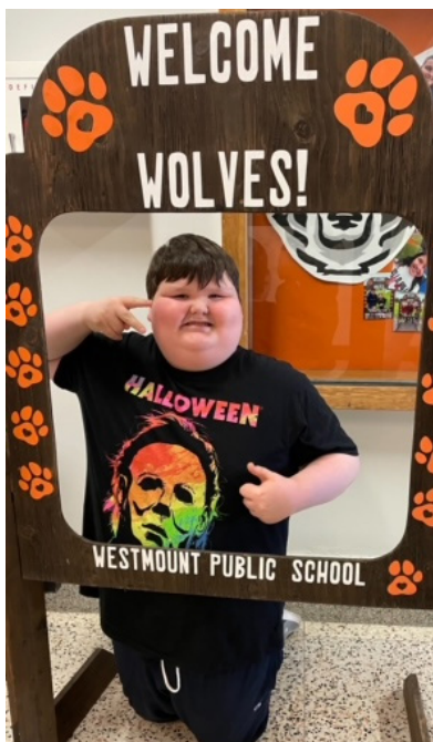
Hunter starting school for the very first time